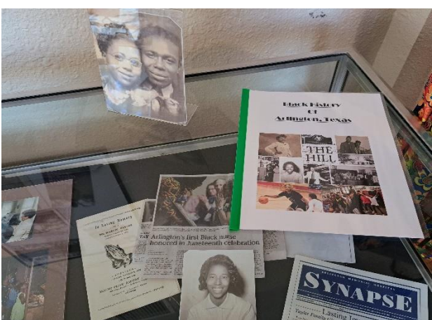
New exhibit at Fielder honoring Black history