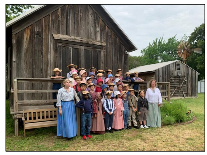
Students from St. Joseph Catholic School at Knapp Heritage Park

It's a great opportunity for us when our venues are used for community events or special tours like this, as it allows us to introduce local history to others who may not be familiar with it.