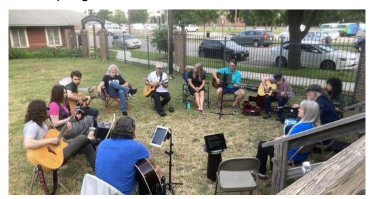
Song Circle at Knapp Heritage Park; photo from event's <u>Facebook page</u>.

In early April, Song Circle began meeting at Knapp Heritage Park. For these Tuesday evening singalongs, musicians would gather with songs and instruments to share music and tell stories amidst the rustic atmosphere of our cabins. Attendance grew from four people to twenty-five. June 27 was the last scheduled session as the summer weather is now here, but we hope to continue this event in the fall or next spring.